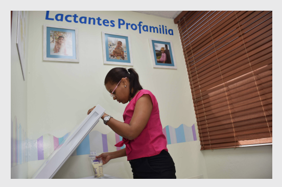
In the breastfeeding room, mothers extract and store breast milk in biosecure manner.

Other actions carried out by Human Management with the collaboration of the Communication and Image Department