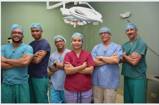
Urology personnel trained in the no- scalpel vasectomy technique

Enjoying good sexual and reproductive health implies having access to services and accurate and timely information to make informed decisions; choosing and having access to a contraceptive method that responds to the particular needs of each person; knowing how to protect oneself from a sexually transmitted infection (STI); being able to decide whether or not to have children, when to have them, and to receive care during pregnancy and childbirth